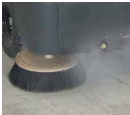
The exclusive DustGuard™ system effectively controls airborne dust by providing a fine mist of moisture to the front and side brushes

PERFORMANCE AND RELIABILITY WITH A CLEAN CONSCIENCE