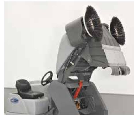
The SW8000 has a superb high-dump capability up to 152 cm from ground level for easy and convenient emptying