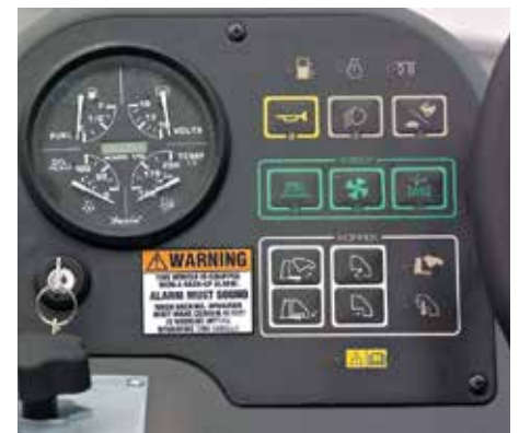
Operation of the SW8000 could not be easier. One-Touch™ control shortens operator-training time and improves the cleaning result