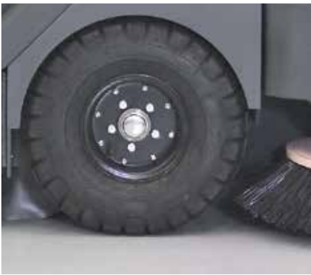
The large wheels give a smoother ride