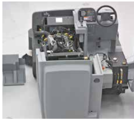
The Nilfisk NoTools™ system makes service extremely easy. The 5-sided access to engine and hydraulic components saves you valuable time and keeps down the service cost